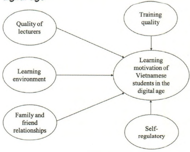
Figure 1: The research model of learning motivation of Vietnamese students in the diaital age

The research applied a mixed method. For the qualitative method, a focus group was conducted on Microsoft Teams in September 2021 for convenience in the social distance period. Informants included 10 students currently studying in economics, social science, and natural science fields at different Vietnamese universities. An interview guide included questions such as "What is your learning motivation?", "What factors influence your learning motivation?", "Does the learning environment influence your learning motivation?", "How about training quality?", "How about teaching methods?", "Do you think self-efficacy influences learning motivation? Why?", "What is the difference in learning motivation before and during the Covid-19?", "Do you have any other ideas?". Results were recorded on Microsoft Teams software and analyzed by the researcher. The answers were grouped by themes (the university,